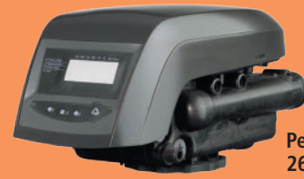
Performa 263, 273/764