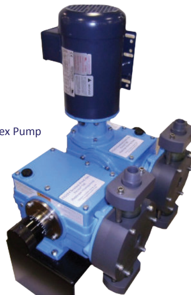
Double Simplex Pump

With UGSI Chemical Feed products, you do not have to compromise on a marginal liquid feed and controls technology for a particular application. Instead, you can choose from multiple technologies to match the best pump to your application.