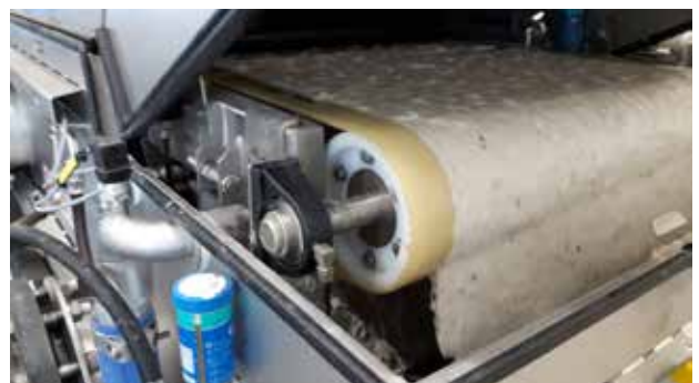
Separated glass fiber particles drop into a collection area.