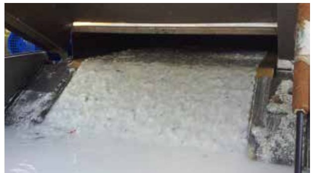
Incoming wastewater meets the filtermesh and glass fiber particles are separated.

Treated Flow: 20 - 40 m 3 /h (88 - 175 gpm) TSS Removal: 30 - 80% TSS Influent Average: 1600 mg/l