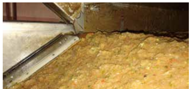
Separated particles build up on the filtermesh creating a "filter mat" to enhance separation performance.

Treated Flow: 100 m 3 /h (0.6 MGD) TSS Removal: 60 - 80% TSS Influent Average: 2100 mg/L