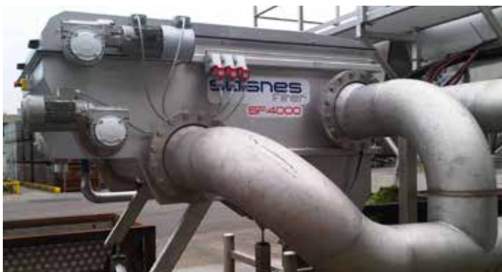
The SF4000 Salsnes Filter installed at the facility.