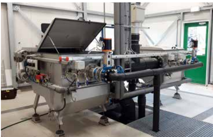
Two SF2000 Salsnes Filters