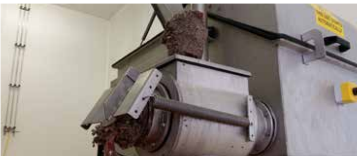
The Salsnes Filter system contains an integrated sludge dewatering unit.