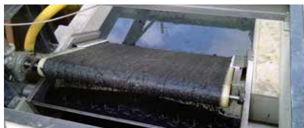
One of four SFK Salsnes Filters installed in a concrete channel.

Treated Flow: 10 - 60 m 3 /h (44 - 260 gpm) TSS Removal: 30 - 80% TSS Influent Average: 4000 mg/l