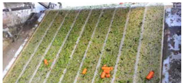
Particles are separated from the wastewater on the rotating filtermesh.

Flow Rate: 140 m 3 /h (0.9 MGD) TSS Removal: 60 – 80% COD Removal: 15 - 40% TSS Influent Average: 2000 mg/L COD Influent Average: 3500 mg/l