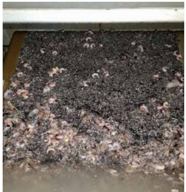
Separated solids build up on the filtermesh and then move onto the sludge thickening and dewatering processes integrated within the system.