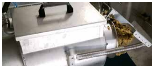
The integrated dewatering unit in the Salsnes Filter system produces a dry sludge.