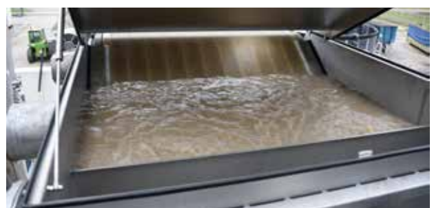
Wastewater enters the inlet and meets the filtermesh where solids separation takes place.