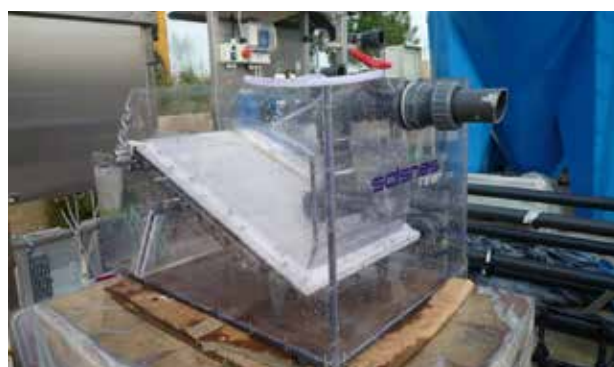
Pilot-scale SF500 Salsnes Filter system

The Salsnes Filter system separates microalgae from the wastewater