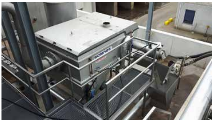
One SF6000 Salsnes Filter