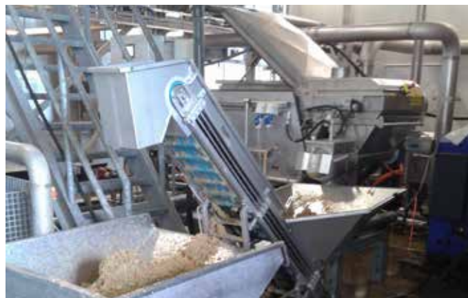
One SF4000 Salsnes Filter is installed to treat 100 m 3 /h (0.6 MGD) of wastewater.

The facility decided to install one SF4000 Salsnes Filter with a 210 micron filtermesh to treat 100 m 3 /h (0.6 MGD) of wastewater. The system successfully removes 60 - 80% TSS which resulted into considerable cost savings in discharge fees as these solids are no longer discharged into the sewer.