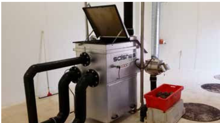
The SF1000 Salsnes Filter installed at the shrimp processing facility

Flow Rate: 20 m 3 /h (88 gpm) TSS Removal: 30 – 80% COD Removal: 15 - 40% TSS Influent Average: 1400 mg/l COD Influent Average: 2000 mg/l