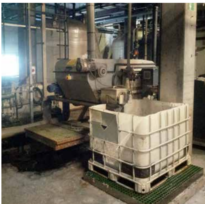
The SF2000 Salsnes Filter installed at the tannery.