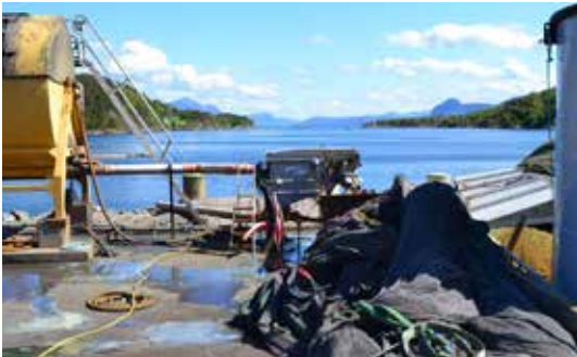
Egersund Net, Kristiansund (archive photo)

Micro-fouling can clog the nets of closed cage systems, impeding water flow. For this reason, periodically, nets are dismantled and sent to stations on land for washing, repair and re-coating. The Salsnes Filter system provides treatment for this wash water before its discharged back into the environment.