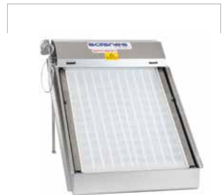
SFK200 SFK400 SFK600