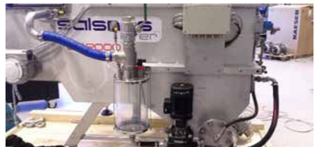
The optional vacuum system can produce sludge with 30% dry content