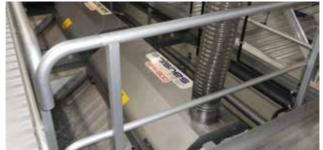
Salmar Follafooss, Norway (Salmon smolt farm)

The Salsnes Filter system has integrated thickening and dewatering processes to help reduce the impact of sludge disposal by producing a smaller volume of drier sludge. An optional vacuum system can be applied to bring dry content levels as high as 30% and reduce sludge volume to 0.48m 3 per ton of fish feed. As an alternative to disposal, sludge produced from our system can be used for biogas production or as an ingredient in fertilizer.