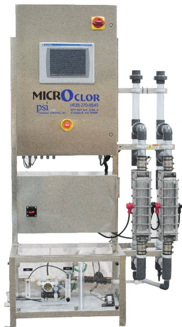
Microclor ® MC-40 System